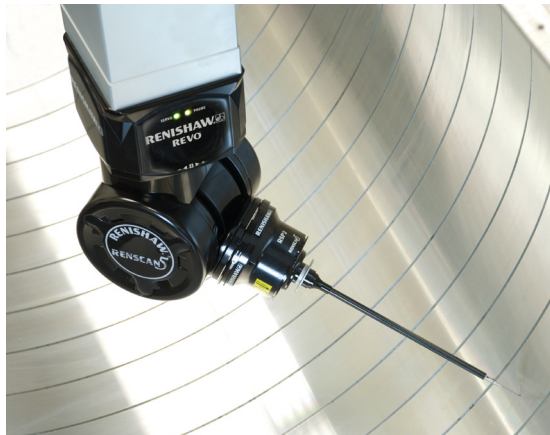
REVO has reduced inspection time on this high precision imaging drum from 1 hour to just 10 minutes