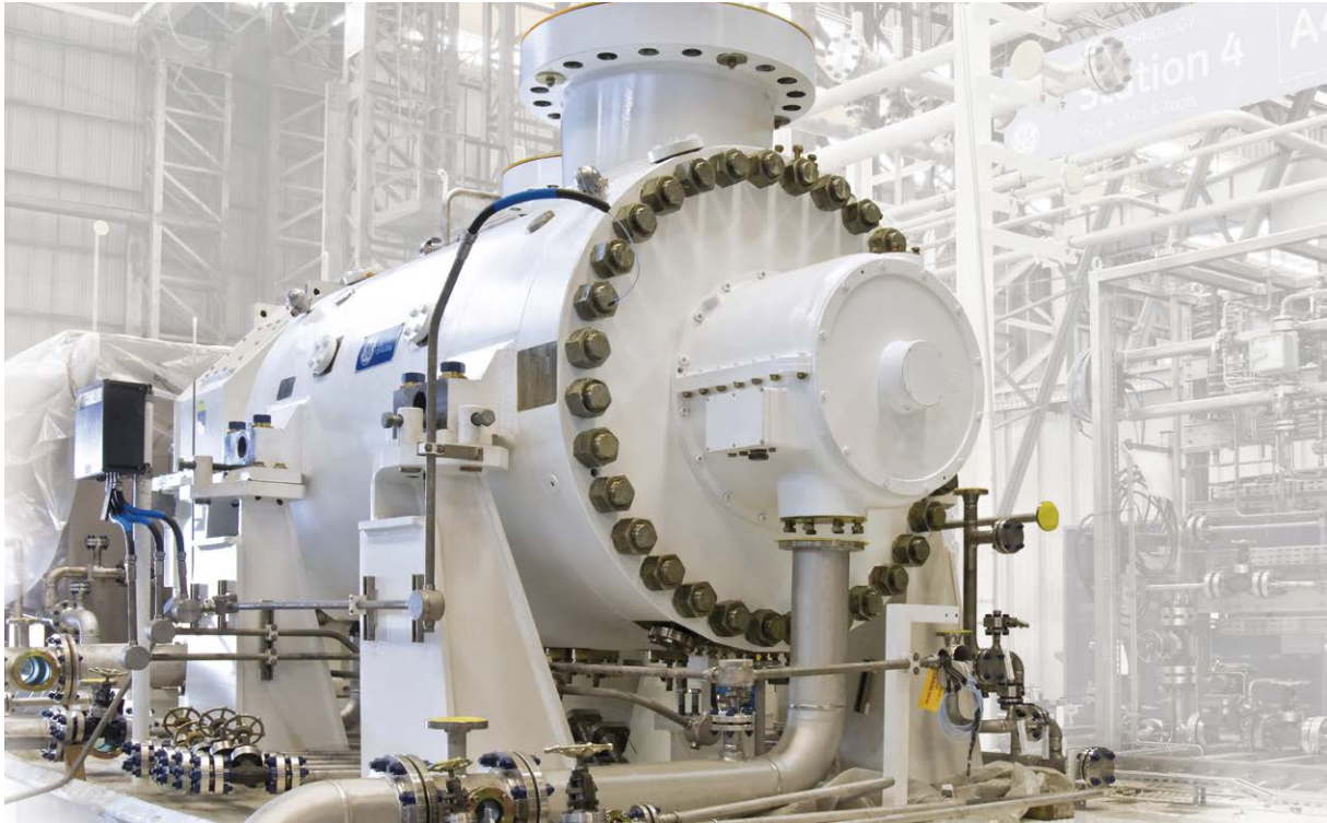
GE Oil and Gas provide high quality compressors with a proven track record of reliability and safety

For more information visit, www.renishaw.com/ge