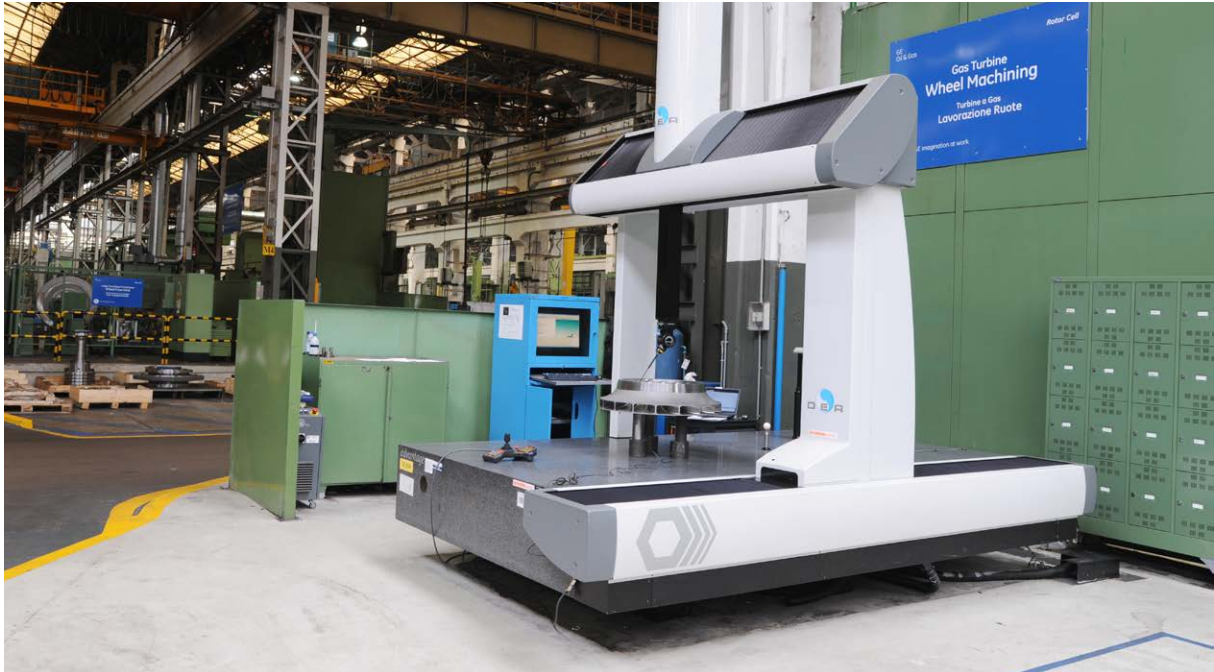
The DEA Global CMM, now capable of far higher data collection rates and form analysis

The compatibility of MODUS with DMIS is very important here. The 3D CAD model generated in the design of the component originally is used for everything, including machining the component in the first place, then verifying its quality. Each component is tracked throughout the process by its serial number, with a full record of every stage in its production. Now GE Oil and Gas will be going one step further and will add extra quality data to that record, with the ability to further improve machining operations.