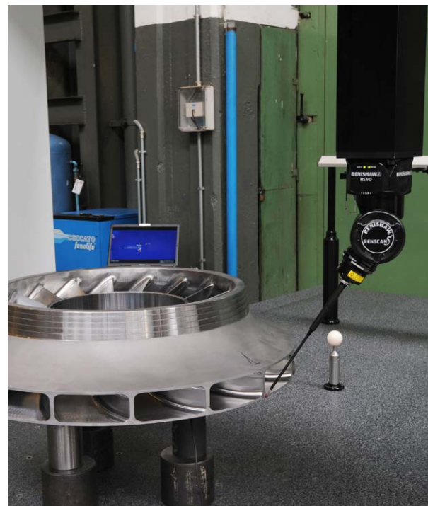
The Renscan 5™ system performing a rapid scan of the impeller diameter

Florence is GE Oil and Gas' business headquarters, with a global installed base of machinery and equipment of more than 20,000 units. Projects include the world's largest LNG compression trains, re-injection of high sulfur gas, enhancing the safety and productivity of the world's oil and gas pipelines, and equipment for the production of oil and gas from deep subsea resources.