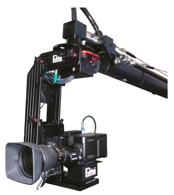
MK II head from Power Plus provides perfect synchronisation between virtual and physical elements in real-time broadcasting.

Seamless integration of VR calls for highly repeatable camera positioning. Power Plus' high precision pan-tilt head and jib employ Renishaw's RESR incremental rotary (angle) encoder system on both the pan and tilt axes, with the RGH40 series non-contact optical readhead (not recommended for new designs, alternative upgrade: QUANTIC™ encoder with RESM scale) offering repeatability to 0.004 arc seconds. Available with a wide diameter range and compatible with a series of readheads, the RESR incremental rotary encoder is designed with low mass and low inertia to ensure great dynamic performance. Backlash and other mechanical effects, created by coupling or bearings, are eliminated by the direct mount mechanism.