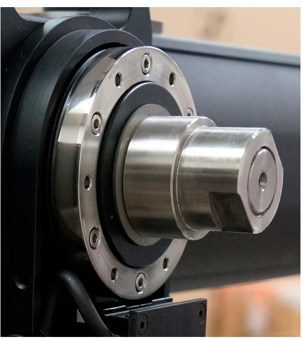
Renishaw's RGH40 optical readhead obtains position feedback from the RESR stainless-steel ring

Mr Wong says: "Compared with the use of traditional enclosed-encoders; the non-contact encoder has excellent repeatability and with zero backlash, which is critical for VR performance. We are very satisfied with Renishaw's encoders which are built for precision." Power Plus employed Renishaw