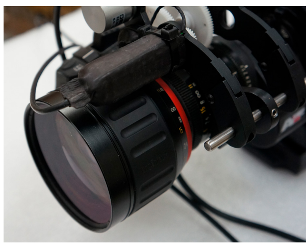
Power Plus' feedback device on the camera head.