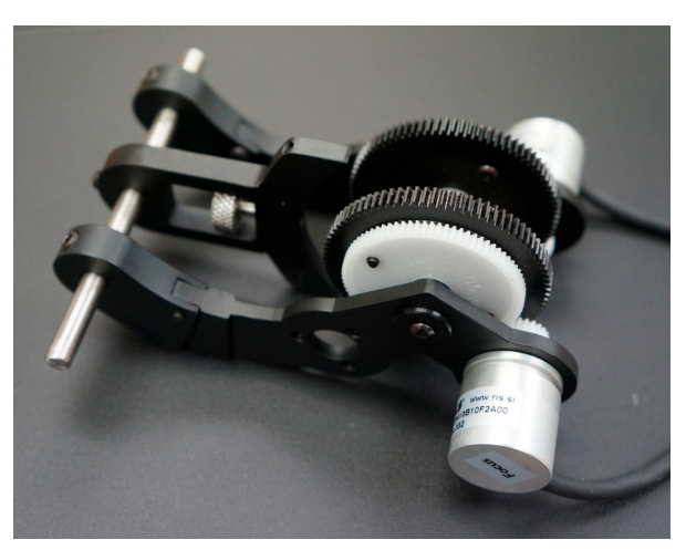
The RE22 provides position feedback from the pan-tilt head allowing stable and precise movement of the camera in the live broadcast.

Simple and fast installation is another trademark of Renishaw encoders. Every readhead features wide installation tolerances and an integral set-up LED, which allows easy installation and removes the need for complex set-up equipment. Renishaw's RESR encoder ring features a patented taper mount which corrects for rotor eccentricity. This simplifies the integration and minimizes installation error. Mr Wong continues: "Installation of the encoder ring could be a headache. However, Renishaw's taper mount design considerably reduces our engineers' workloads and allows us to easily know whether the installation has been successful just by reading the set-up LED."