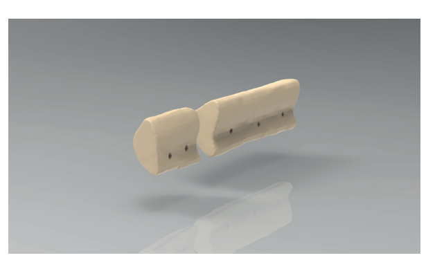
Fibular sections after cutting and drilling

After Mr Thomas located the best target section of the fibula and fibula flap to harvest, PDR designed a cutting guide to help him remove, with precise control, two sections of bone and vascular connective tissue.