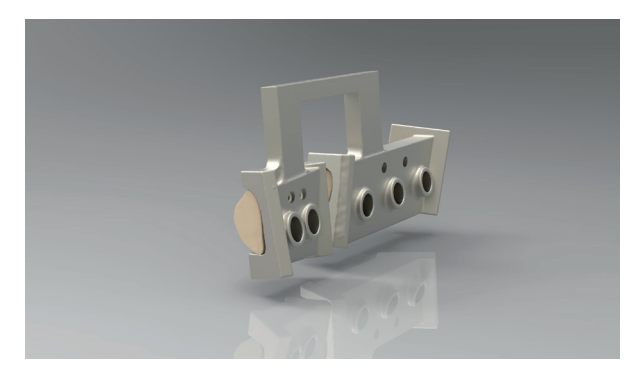
Fibula sections with cutting guides attached

UHW was unwilling to face that risk. Additive manufacturing allowed the specific and complex geometries of each component to be produced and built as single pieces.