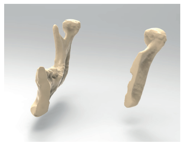
Jaw with cutting guides in place