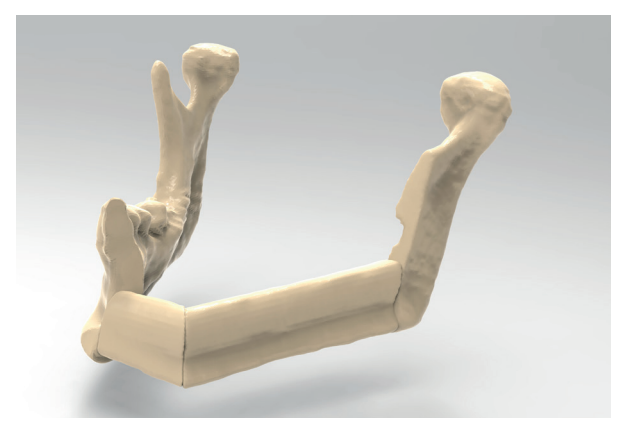
Jaw with second cut section of fibula in place