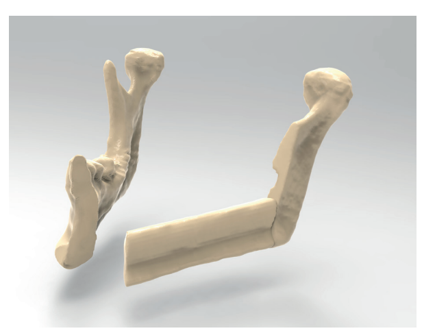
Jaw with first cut section of fibula in place

Two "push and click" features were designed and manufactured into the front and back of the mandibular plate to enable Mr Thomas to know that the bones and connective tissue had been positioned as planned.