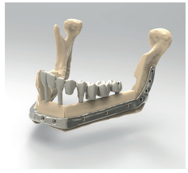
Jaw with fibula sections retained in place by mandibular plate