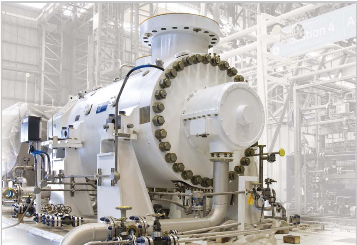
GE Oil and Gas provide high quality compressors with a proven track record of reliability and safety

PC-DMIS is a registered trademark of Wilcox Associates, Inc