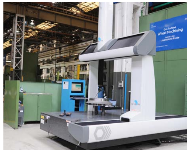
The DEA Global CMM, now capable of far higher data collection rates and form analysis