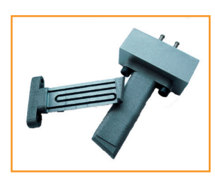
Tool with conformal cooling