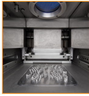
Laser melting machine build chamber