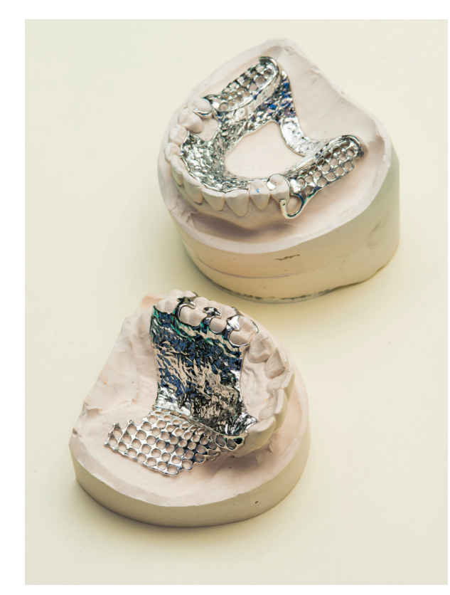
A 3D printed RPD, polished and ready for build up.

So a digital denture framework is nearly a reality but there is still no end-to-end workflow from the design stage through to the manufacture without major manual input.