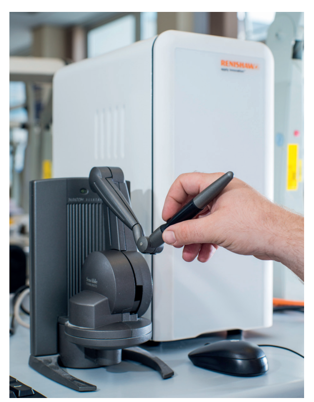
Haptic arm and DS20 scanner