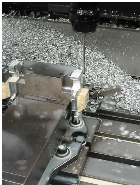
MP10 spindle probe setting the component for further machining operations