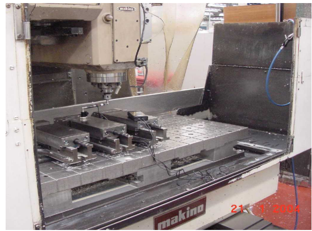
QC10 ballbar performing a quick performance test on a Makino 160 milling machine: the diagnostic results allow immediate adjustments to improve machining accuracy

Probes have also found applications on three Makino 106 CNC milling machines, each twenty years old but still in full production and expected to hold consistent tolerances on key components. The probes are used for job set-up in several different ways, for example, forged billets are clamped into the vice and the probe checks certain features to detect any variation in the forging. The readings can be used by the machine's control to 'decide' where machining starts and how many cuts are required, eliminating 'fresh-air' cuts and any scrap due to setting.