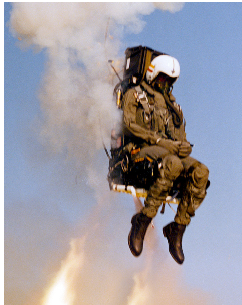
Martin Baker seat in use with the US Navy