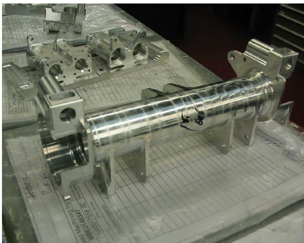
Typical complex components, quality is critical to the reliable operation of the seats

The complex machined components that go into the seats have multiple features, and demand very high standards of quality control to ensure reliable operation in the toughest conditions. Aluminium is the most common material, and with the machine time and resources almost all finished parts are of a high value, so minimising scrap is of paramount importance.