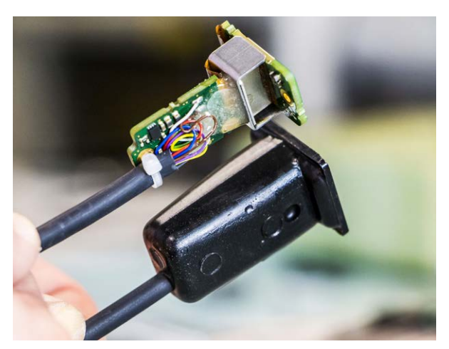
The RLS LinACE™ repackaged into a waterproof enclosure

In this case, a magnet is attached to the back of a Hall sensor array and is used in conjunction with a ferromagnetic scale, which has a series of lines (grooves) etched into it. The grooves in the scale surface produce changes to the local magnetic field, such that when the sensor is moved over the scale, a moving magnetic pattern is detected by the Hall sensors, which is then converted into a position measurement. Because the pattern of the scale grooves is non-repeating, the absolute position can be determined anywhere on the scale. The sensor head assembly is completely encapsulated to protect its sensitive microelectronics from the elements. The outer polymer layer also gives a sacrificial surface on to which the scale makes full contact, which ensures correct ride height. Magnetic encoders are unaffected by encapsulation.