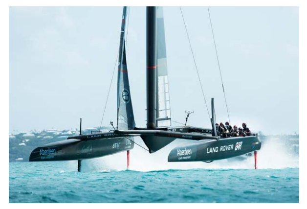
The R1 at speed in Bermuda

Now, consider the implications of high-speed winds and salt spray going everywhere – open optical encoders would be a real challenge because you must keep the optical path clear. Magnetic encoders, therefore, were the only viable alternative. These encoders can be fully sealed giving much greater contamination resistance, which is essential for this application. Protecting against the harsh environment was one of the main reasons for our choice. Other reasons were space limitations surrounding the highly loaded wing ribs. By using LinACE<sup>™</sup> modules from our associate company RLS, we could design a new encoder that minimised the size of hole needed within the wing rib. We satisfied 3 major technical constraints by designing an encapsulated encoder: reduced size, environmentally sealed and an integrated sliding bearing for maintaining position on the partial-arc encoder plate.