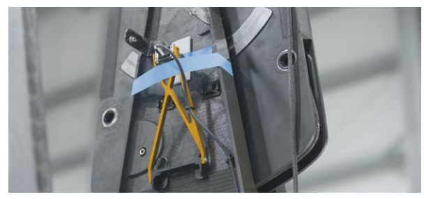
The encoders installed on a hammerhead (flap control plate)

By using encoders directly on the control surface, or as near as possible, you get a much more accurate reading of the angular position of the control surface.