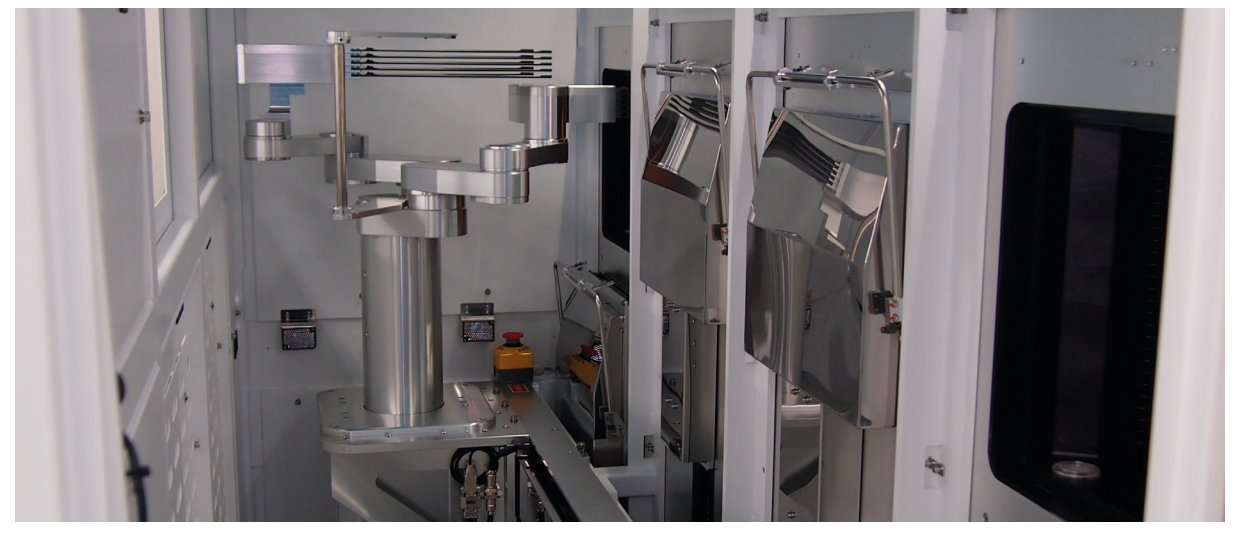
Wafer transfer robot