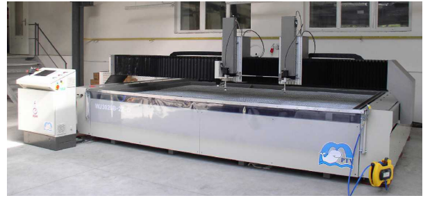
The finished machine, which is laser compensated at the factory and then checked again during installation at a customer site

The ML10 laser interferometer measurement system is a reference standard on which PTV relies, using the highly stable wavelength of laser light, to provide performance verification to ISO 230-6 and traceability of the measurements in line with their ISO9001 certified systems. PTV sees both these factors as crucial in winning new customers, especially in markets where it is unknown.