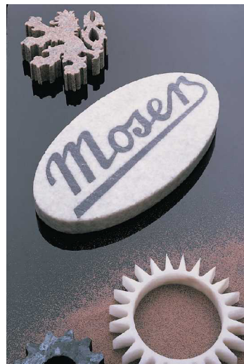
Typical components cut with PTV water-cutting machines