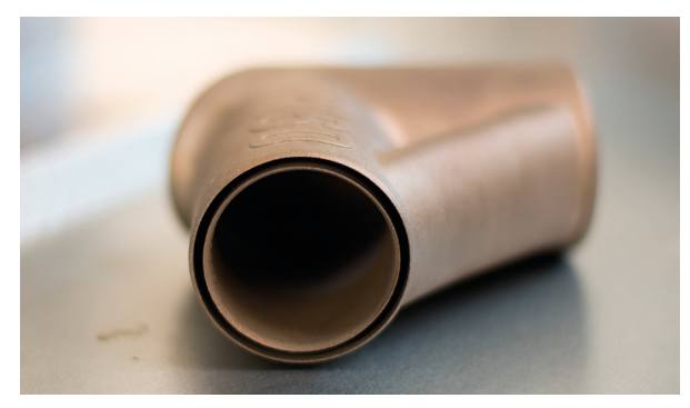
Producing the titanium parts with additive manufacturing allows doublelap shear joints to be used to join the metal lugs to the composite tubing.