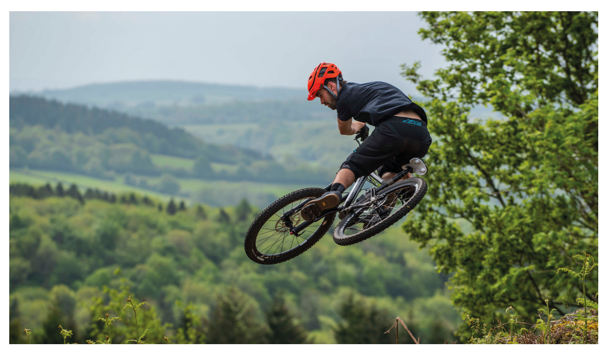
Robot Bike Co. R160 customised carbon fibre and titanium mountain bike frame in action.

The parts generated by the software are then manufactured on Renishaw's advanced metal additive manufacturing systems at one of Renishaw's Additive Manufacturing Solutions Centres. These centres provide a pre-production workspace where users of additive manufacturing can prove out processes and buy time on dedicated Renishaw additive manufacturing systems, with support from Renishaw expert engineers and technicians.