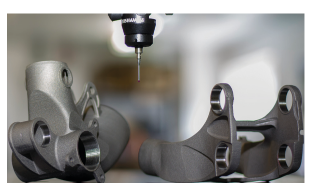
The final stage in the production of the titanium parts is inspection using Renishaw probes.

It was clear that additive manufacturing would be the only way to produce the wide variety of unique parts needed for each of the bespoke mountain bikes. However, the titanium components needed to be robust enough to withstand the demands of extended use under constantly varying loads, be as light as possible to give the optimum ride, and be able to be bonded reliably to the tubing.