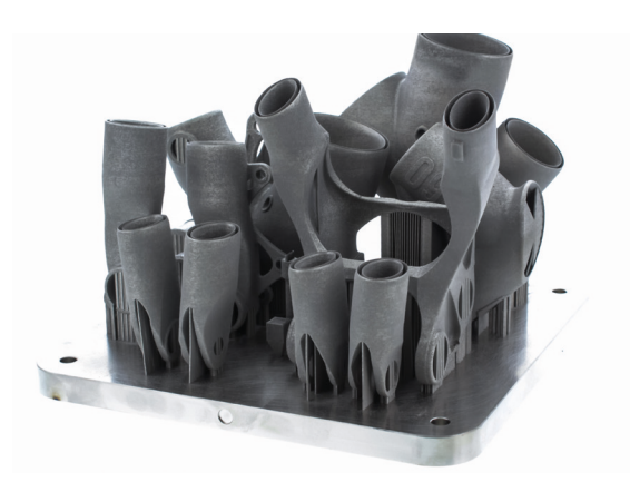
The complete set of titanium joints are produced on a single build plate on Renishaw's additive manufacturing system.