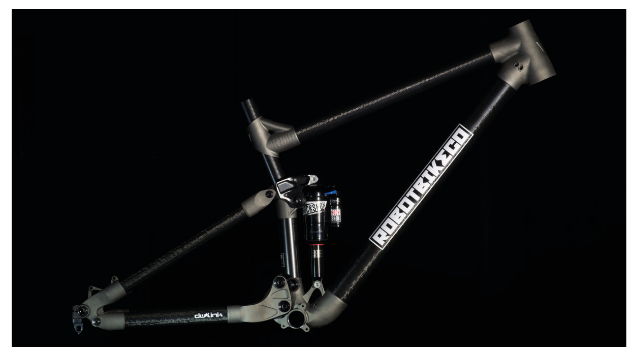
The novel frame design is made up from carbon fibre-reinforced tunes connected with titanium joints.

This now sits behind the Robot Bike Co. website, allowing customers to input quickly the required body measurements, and then to generate a bespoke design matching their needs in a quick, easy and automated process.