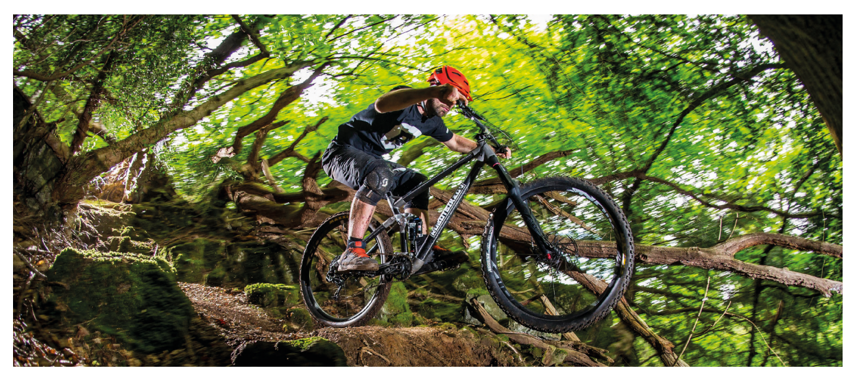
Robot Bike Co. R160 carbon fibre and titanium mountain bike frame is suited to steep and technical terrain.