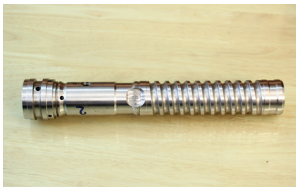
The Primo system helps in setting the steering worm shaft accurately for slot milling on a vertical machining centre

Prior to installation of the Primo system at SuMax, tool pre-setting operations had to be carried out off-line in a tool crib by a skilled engineer. The operator would have to remove