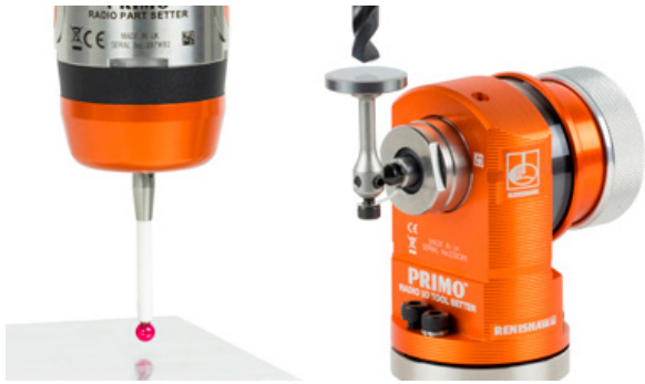
The Primo™ system, including Radio Part Setter and Radio 3D Tool Setter

Using a Primo system has helped SuMax to increase machine utilisation time, eliminate scrap and reduce the time consuming tool setting process. SuMax was attracted to the Primo system's 'pay-as-you-probe' concept with a low initial investment and a unique credit token system. Moreover, the Primo Total Protect cover provides complete peace of mind and safeguards the Primo system against any accidental damage by providing a comprehensive warranty.