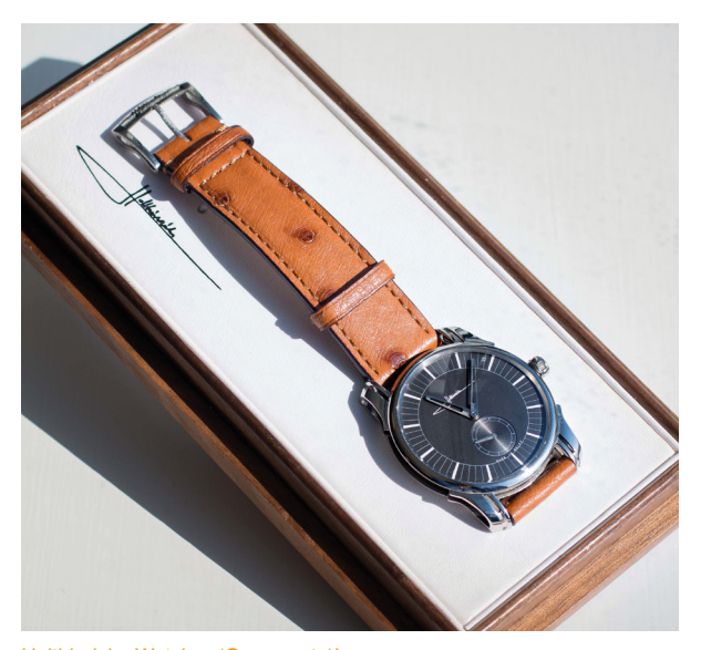
Holthinrichs Watches 'Ornament 1'.

His plan is to develop a core range of classic style watches that are high-end and have a strong element of personality, but which could be completely customised like bespoke jewellery.