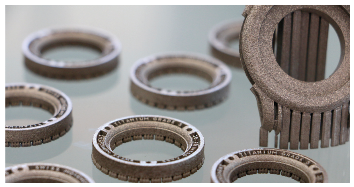
'Ornament 1' watch case printed in titanium on a Renishaw AM 400 system.

The case, crown and buckle of the 'Ornament 1' were metal 3D printed in stainless steel 316L. The watch case has a diameter of 38 mm and is only 10 mm thick; it has a raised inscription of the Holthinrichs brand on its edge with the words 'stainless steel', '3D printed case' and 'Swiss movement', in capitals on its reverse. These details were achievable only by using metal AM.