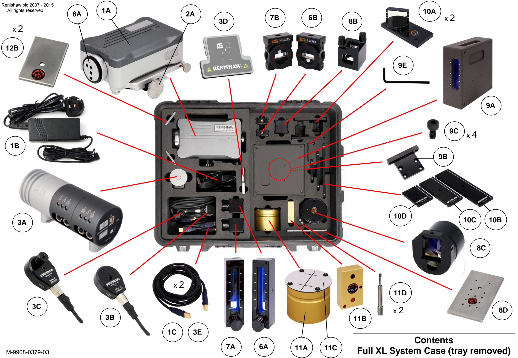
Contents Full XL System Case (tray removed)