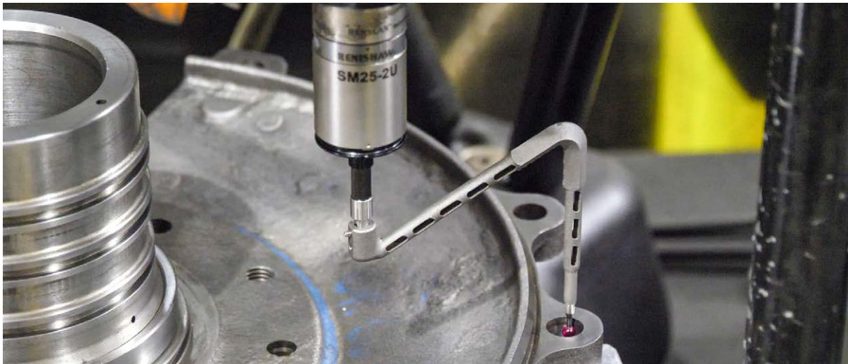
Custom stylus metal 3D printed on a RenAM 500Q system

A few years on and the original AM stylus is still running without any degradation in its performance. Linex purchased a second AM stylus in the exact same design, and the company is now operating six Equator 300 gauges and one larger Equator 500 gauge.