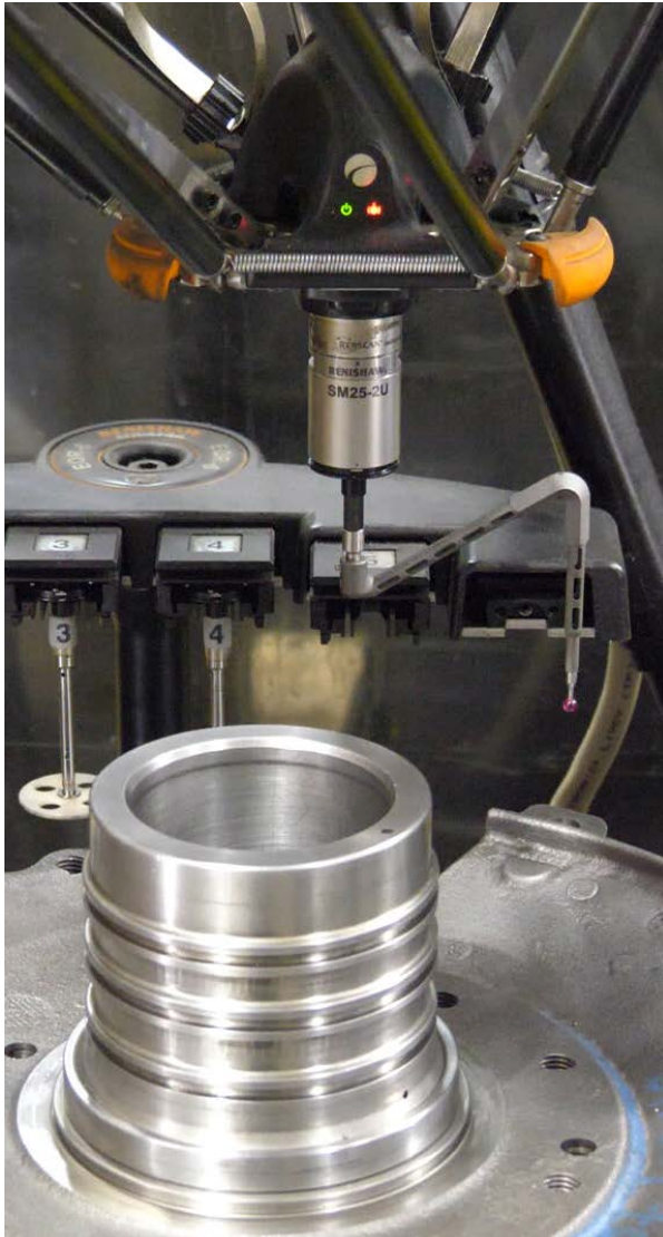
Inspecting automotive component on Equator 300 with additively manufactured stylus

Capable of component scanning speeds in excess of 200 mm/s and maintaining high accuracy over the temperature range of 5 °C to 50 °C, the Equator 300 provided Linex Manufacturing with a versatile diametric inspection volume of 300 mm to a height of 150 mm, capable of supporting workpiece weights up to 25 kg.