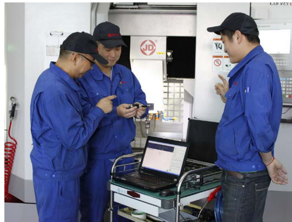
Jingdiao employees discussing the use of QC20-W ballbars