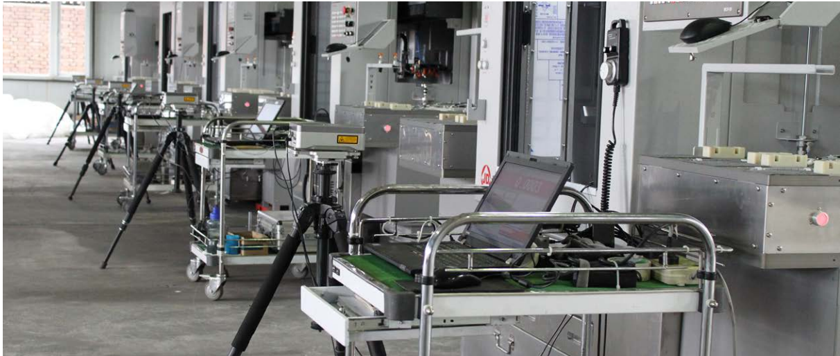
XL-80 lasers and QC20-W ballbars are used to carry out final precision calibration of engraving machines before they leave the factory.

highest precision requirements. The NC4 non-contact laser tool setting system utilises laser beams to measure the dimensions of grinding wheels, while the measurement data is able to automatically update cutting tool parameters. The NC4 can be used to monitor grinding wheel wear and make instant repairs, not only saving time on grinding wheel measurement, but also guaranteeing high levels of measurement precision.