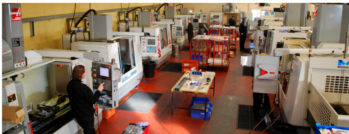
Mekall has standardised on HAAS machine tools with 10 VMCs and 2 turning centres