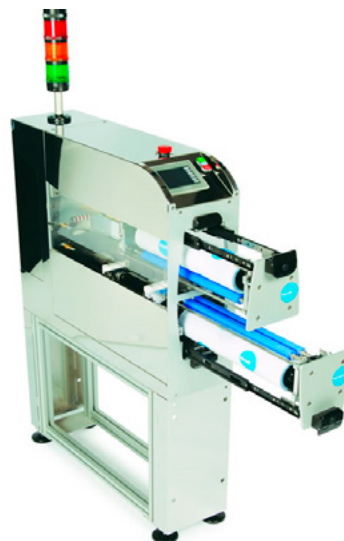
Mekall machined parts can be clearly seen on Teknek SMT cleaning machines

Mr Forsyth continues, “Knowing you have the probe shortens the development time considerably, removing the need to design and develop fixtures, since you don’t need to