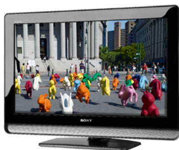
Sister company Teknek supplies Sony with SMT cleaning machines for flat screen TV production

machine tools, they had big problems on a very accurate job for Thales. The position of machined features could vary by up to 0.1mm over the course of a shift, which was all down to operator error.