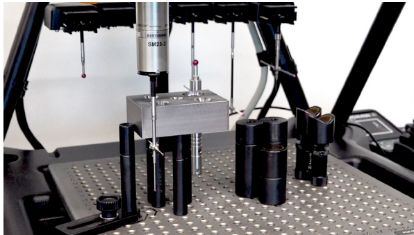
Renishaw's Equator gauging system inspecting a NIMS machined part