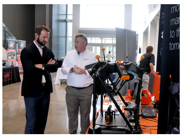
Demonstrating the Equator gauging package for NIMS at the annual Haas Tech (HTEC) Conference

The NIMS inspector credential has been hugely beneficial as it has enabled schools to inspect machined parts in-house. However, it can also be difficult to check in-volume parts consistently and in a time effective manner. The Renishaw Equator package has enabled students to inspect their own parts and know within 3 minutes if their part has passed or failed, teaching them where they have made any mistakes and immediately how to resolve them.