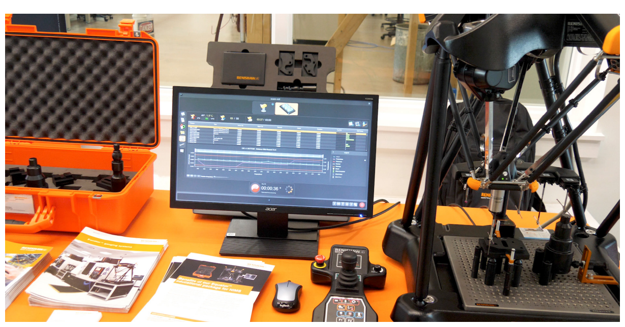
The Equator gauging package for NIMS includes prewritten programes, styli, two metrology fixturing plates, and fixturing that fits all 13 parts

Renishaw has now provided multiple packaged systems to USA high schools and technical colleges that offer NIMS certification, as well as in-house industry apprenticeships.