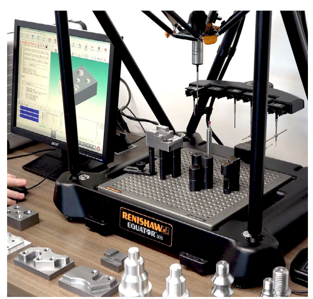
Renishaw's complete Equator gauging system package for NIMS

To uphold student skill levels to current manufacturing industry standards, many trade schools in the USA have aligned their training with certification from the National Institute of Metalworking Skills (NIMS). Tailored directly to this initiative, global engineering technologies company, Renishaw, has developed an Equator™ gauging system package which significantly improves the inspection of NIMS parts. Renishaw ensures that the system is easy to use and that users are well supported every step of the way.