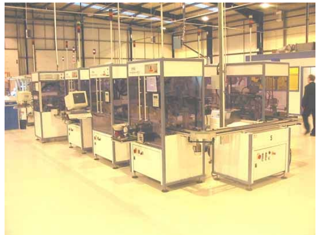
The Sarantel antenna assembly line