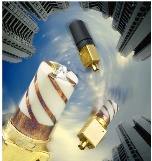
Sarantel's PowerHelix™ antennas

The Renishaw graduated tape scale has been applied to an Invar bar, chosen for its zero-expansion properties. The RGH22 optical readhead travels with the spindle stage. Like the Invar bar, it has been mounted very close to the working volume to maximise the machine's metrology performance. In this way, the encoder system