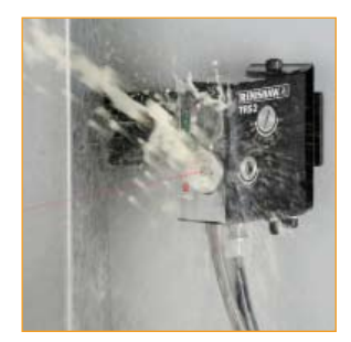
TRS2- broken tool detection system

Renishaw OMV is a 3D verification package, ideal for manufacturers of complex parts such as mould tools. It produces simple and enlightening reports, and plots data back onto the CAD model using powerful CMM-style algorithms.