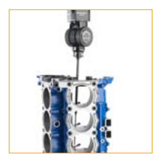
REVO™ – servo scanning head probing system

REVO™ is a revolutionary servo scanning head probing system incorporating Renscan5™ technology, which makes it possible to accurately measure at speeds of up to 500 mm/second, and virtually eliminates the measurement errors normally associated with scanning at speed on existing 3-axis scanning systems. A 5-axis system achieves this by allowing the lighter measuring head to perform most of the motion during inspection routines, minimising the dynamic errors caused when moving the larger mass of a CMM's structure.