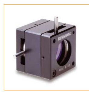
LS350 (patented) – easy laser system set-up