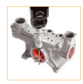
PH10M – fast automatic indexing