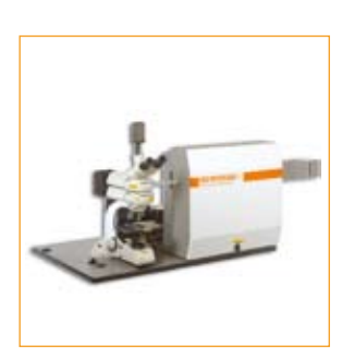
inVia Raman microscope