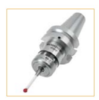
OMP40-2 – ultra compact spindle probe for setting and inspection