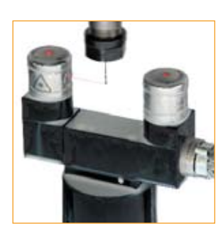
NC4 Compact – non-contact laser tool setting