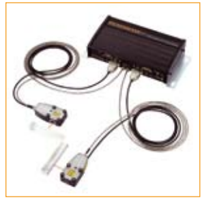
RLE laser encoder