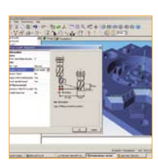
Productivity+™ Active Editor Pro - advanced design of process control and probing strategies via a CAD interface