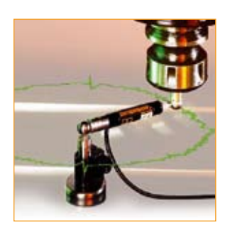
QC10 ballbar – fast machine tool performance testing