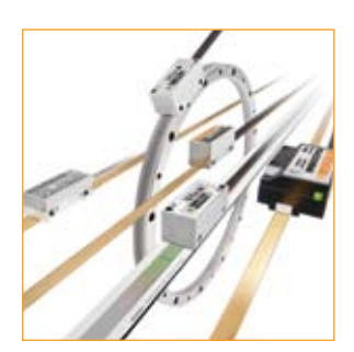
Optical linear and angle encoders