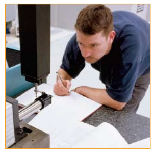
Custom product undergoing final test

Renishaw has a high commitment to customer care. Should any problem arise, a core team of skilled technicians, based in the UK and at the Group's subsidiary companies around the world, is ready to provide service or perform test and re-calibration, as may be required.