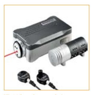
XL-80 interferometric laser system - comprehensive assessment and calibration