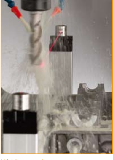
NC4 laser tool setter