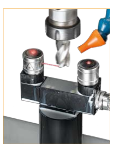
NC4 compact checking a tool for breakage