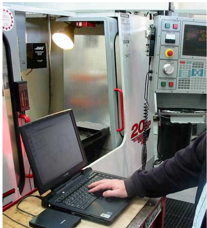
The QC10 ballbar test is controlled with software on a PC, the data gathered will then be analysed with Ballbar diagnostic software off-line