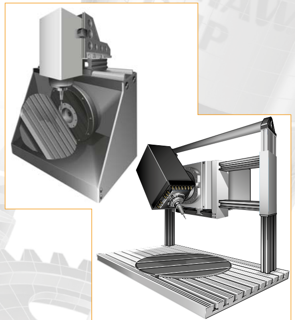
Support for multi-axis machine tool configurations, including those that modify spindle orientation

Custom macros, the programming method which allows the creation and addition of bespoke solutions into Productivity+ probing routines, can now be programmed with references to multiple probes and work coordinate systems. When posted, these macros are then able to report information and values related to these elements which can be saved to a machine variable, extracted as a parameter for use in further programs, or used in subsequent logic conditions.