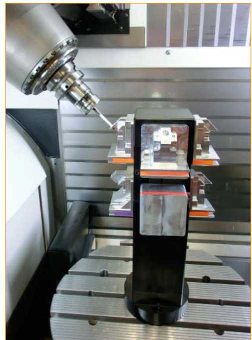
Multi-axis component inspection on 'nodding head' style machine tool