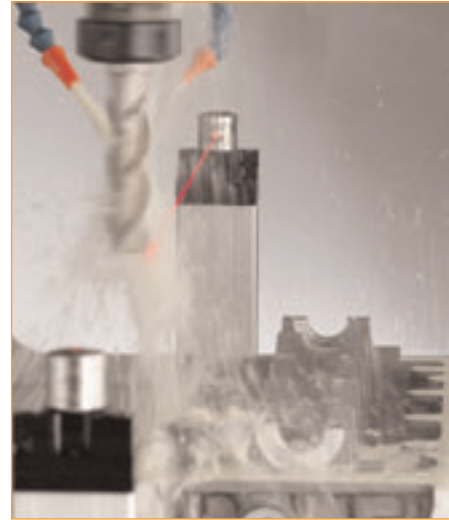
NC4 laser tool setter

Details of system kits and spare parts can be found at www.renishaw.com/NC4