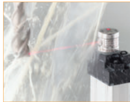
NC4 checking a tool for breakage with coolant running

For worldwide contact details please visit our main website at www.renishaw.com