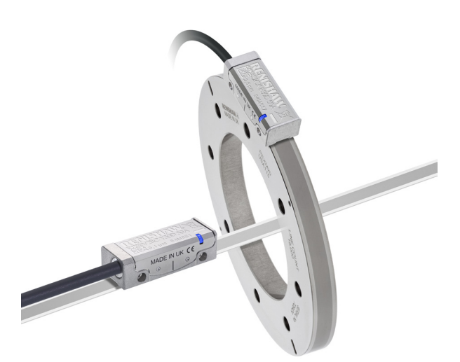
VIONiC readhead with REXM rotary ring and RTLC linear scale

For further information on VIONiC systems, please visit www.renishaw.com/vionic.