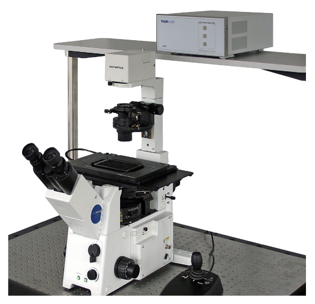
Micro-positioning in microscopy