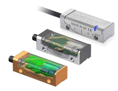
VIONiC digital all-in-one encoder series

The VIONiC range has been designed to reduce overall system size to the minimum achievable for a high-performance system, whilst delivering class-leading performance in terms of cyclic error, jitter, speed, resolution and accuracy. Customers can choose between two VIONiC readhead variants. The standard VIONiC readhead features a cyclic error of <±30 nm, a range of available resolutions from 5 µm to 20 nm,