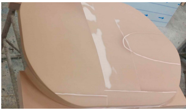
An OMP40 part setting probe and TS27R tool setting probe were used in the setting processes for the 16-section mould for the fibreglass

Probing was especially beneficial due to the time pressure of the job in question. "We had to run the machine 24/7 over 10 days to get the moulds produced on schedule, which meant coming into the workshop at midnight to set up the next block. At that time of night, the fact we could set datums automatically was a major bonus," says Darren George.