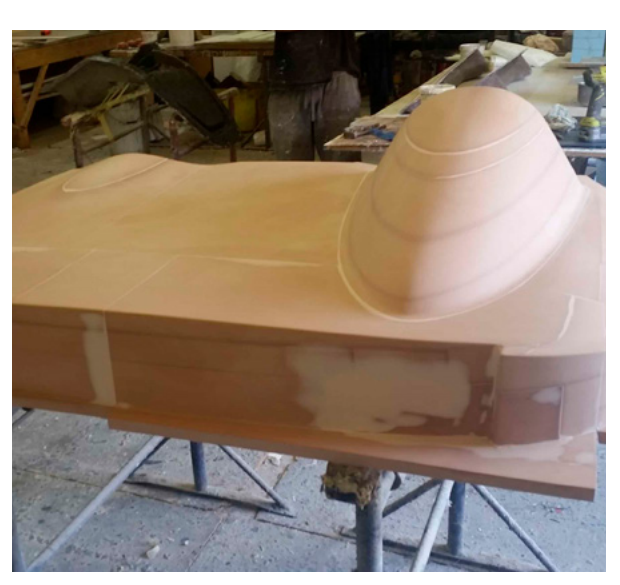
The 16 sections had to fit together accurately to ensure that the fibreglass mould would require the minimum of hand finishing

While these on-machine time savings through use of the Renishaw OMP40 probe are significant in themselves, the most significant time savings occurred once the 16 sections were assembled. Darren George estimates that a mould of this type and size would normally require between one and two days of hand finishing. This was virtually eliminated thanks to the accuracy of the initial machining. This meant that assembly was straightforward, with minimum discrepancies between neighbouring sections.