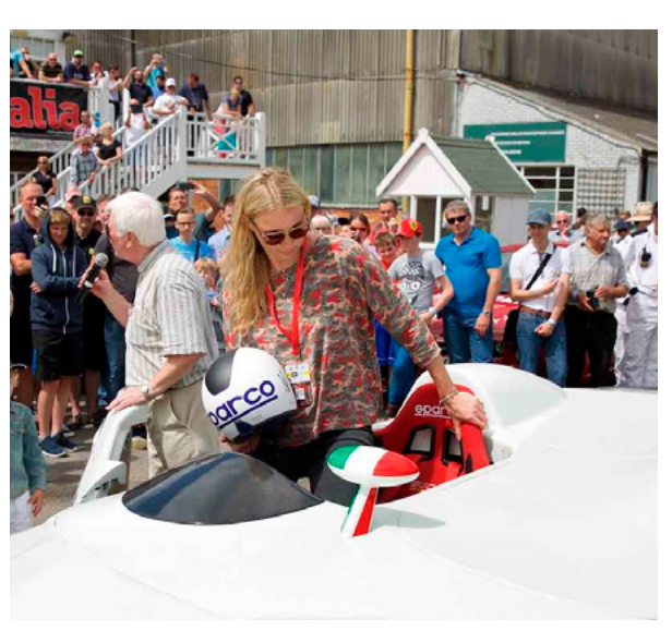
The finished project was unveiled by supermodel and racing driver Jodie Kidd at Brooklands before heading off to Italy for the Best of Italy festival