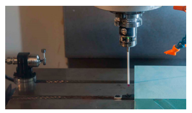
The Renishaw OMP40 part setting probe was used to set the datum of 16 blocks of 0.7 density PU modelling board